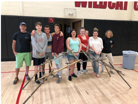
Pipelines & Pathways Program Begins A new program to better engage high school students with local career opportunities started this year, with a full staff person now working within Windham's four high schools.