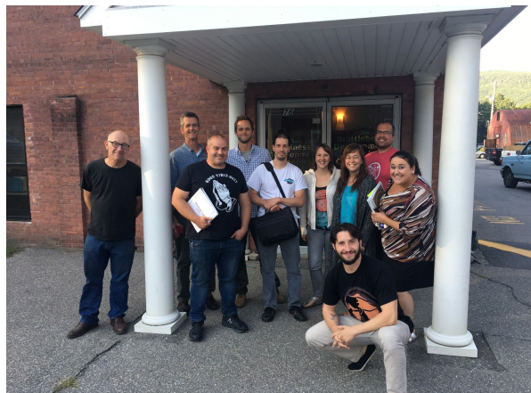
Small Businesses 729 Entrepreneurs benefited from small business and startup support through INSTIG8 workshops and events, one-on-one technical assistance, financing, and Incubator services.