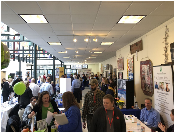
Annual Southern Vermont Career Expo 603 local Job seekers were helped through Career Expo and Rapid Response events.