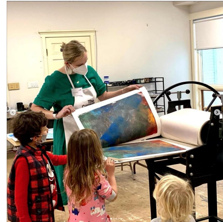
The Current, Stowe