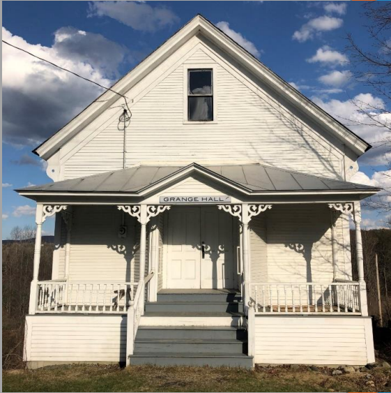
Caledonia Grange Hall, East Hardwick

Funded activities must take place between September 1, 2023 – August 31, 2024.