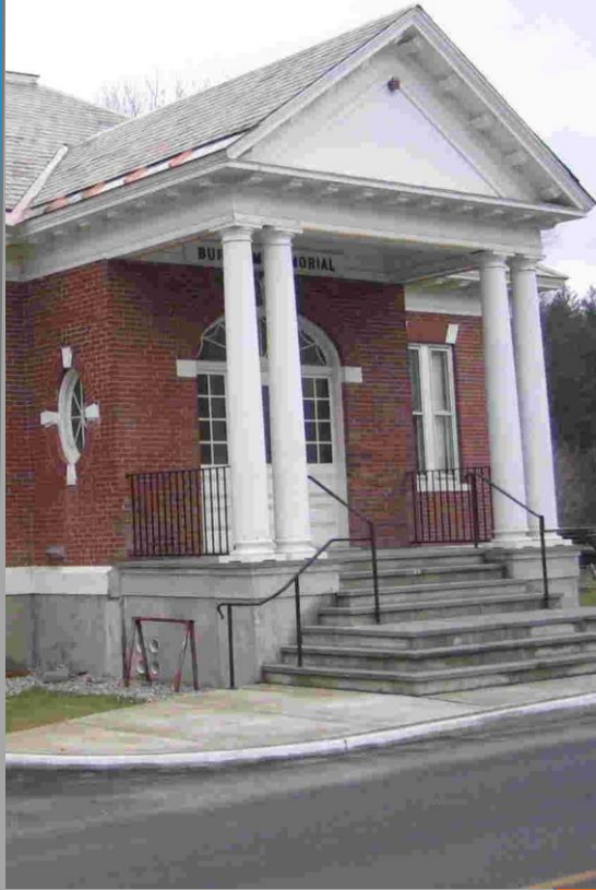
Burnham Hall, Lincoln