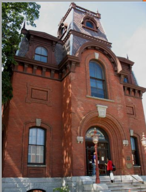
St. Johnsbury Atheneum

Cultural Facilities Grants provide critical funds to nonprofit organizations and municipalities to enhance, create or expand the capacity of an existing facility to provide cultural activities to the public.