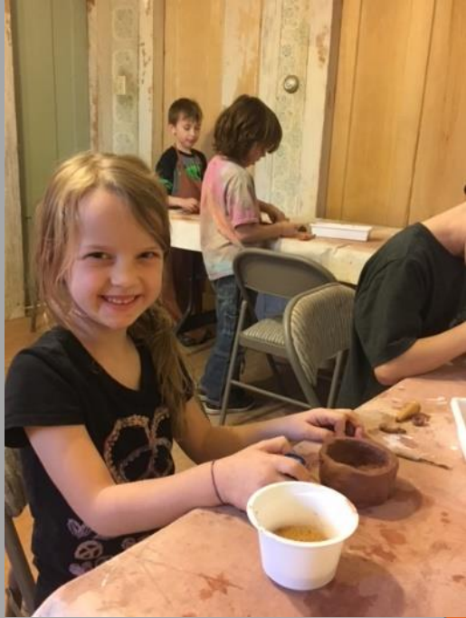
Leach Public Library FY18 Grantee Children in a ceramics workshop