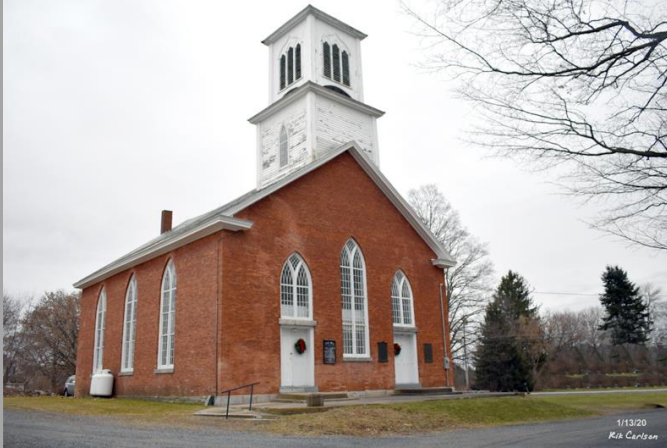
Union Meeting Hall, Ferrisburgh